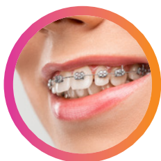
During and after orthodontics (braces and clear aligners)