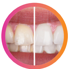
Before and after tooth whitening