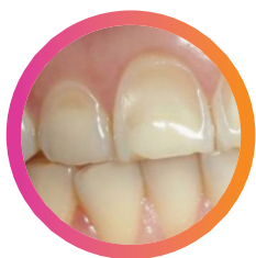
Erosion, oral acids from reflux and morning sickness