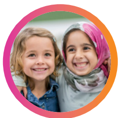
Children and adolescents