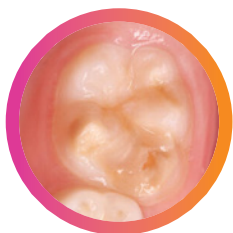
Dental developmental defects and chalky teeth