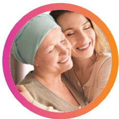
Chronic disease sufferers and certain medication- related oral side effects