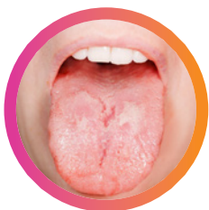
Dry mouth conditions and Xerostomia